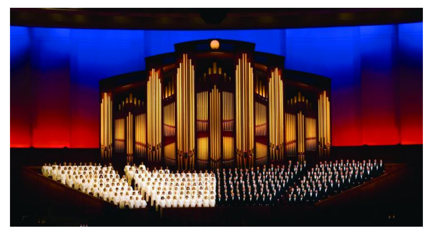
Click on the picture above to read more about this Choir

Featuring modern and traditional arrangements of spiritual, patriotic, popular, classical and contemporary music coupled with timely, inspiring prose, Music & the Spoken Word becomes an uplifting, rejuvenating destination that listeners and viewers return to every week.