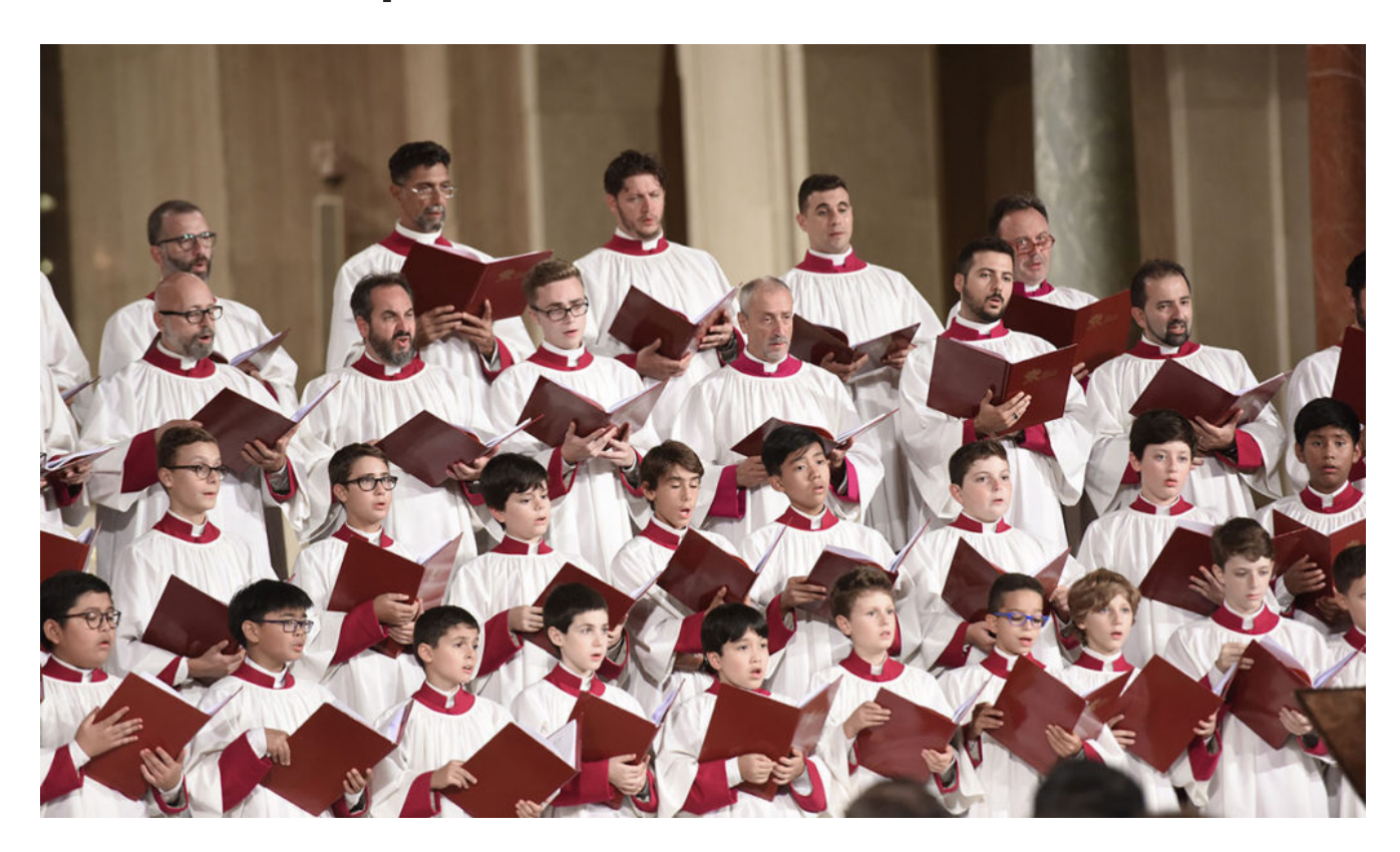
South Korean Children's Choir