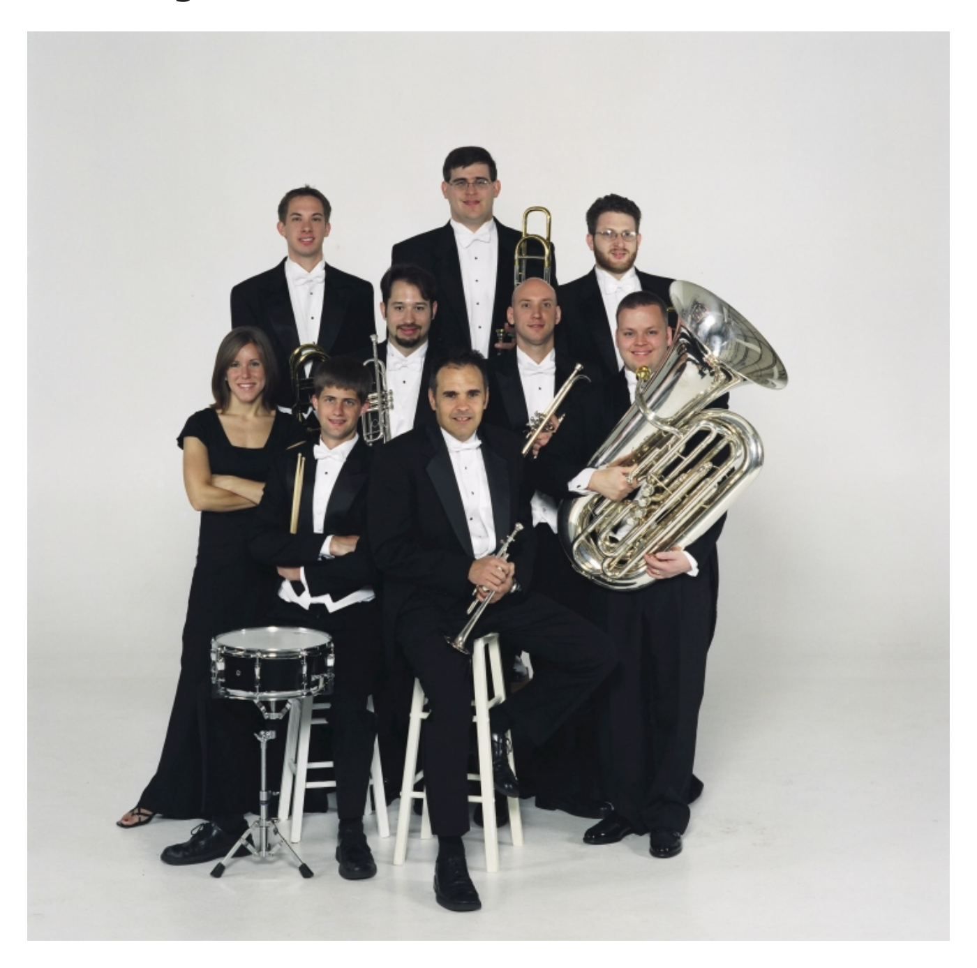
London Philharmonic Orchestra