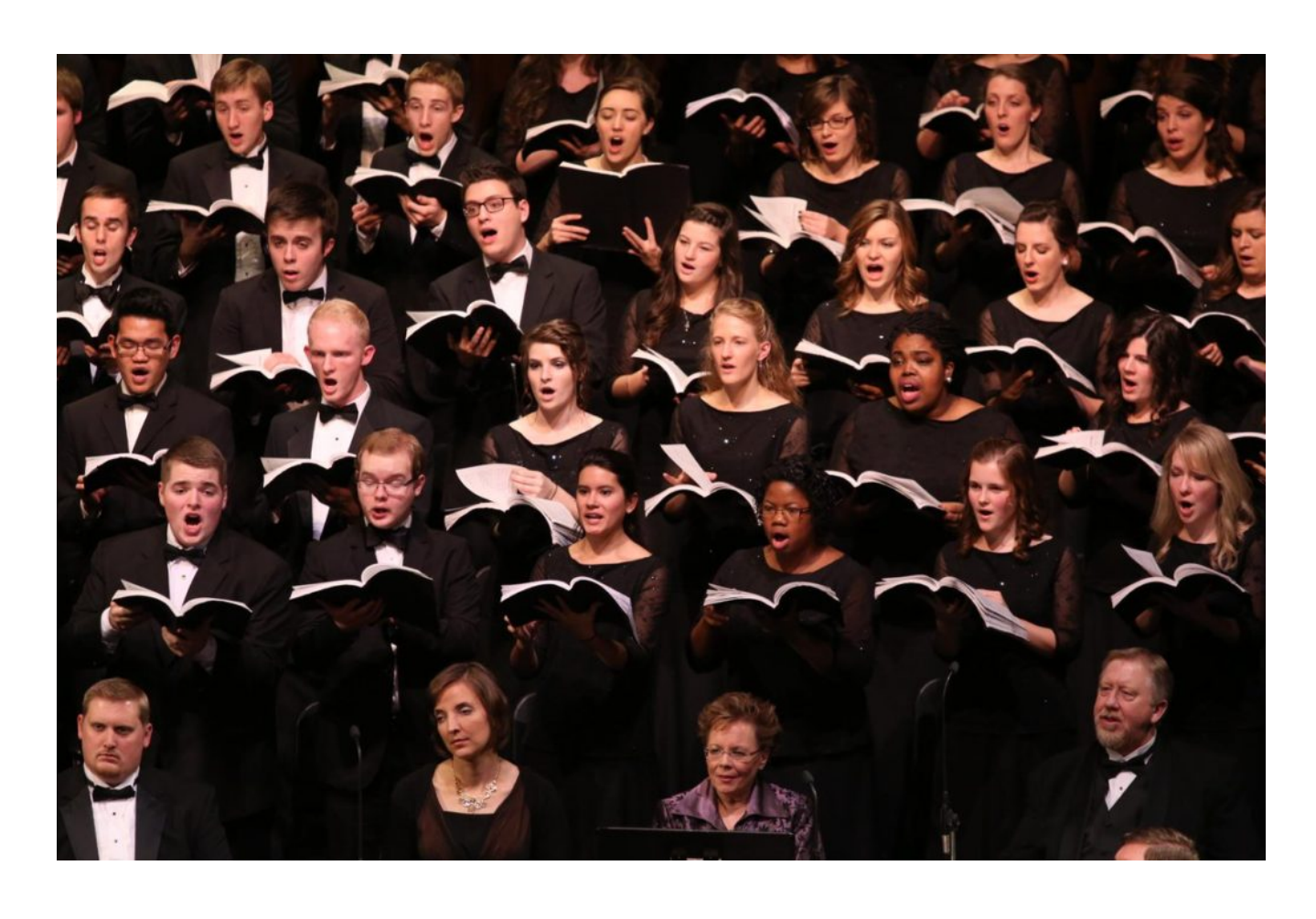
Kings College Choir Cambridge