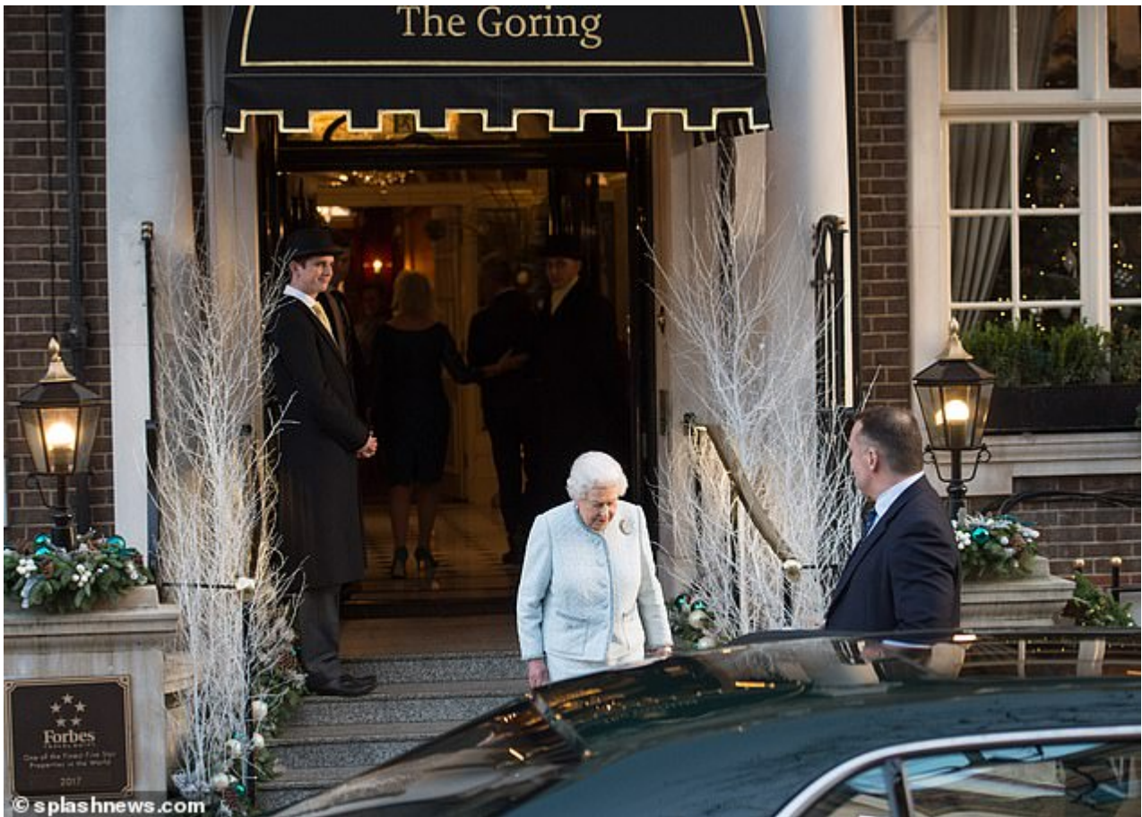
The Real LONDON HOTEL! We Love this hotel and the management!