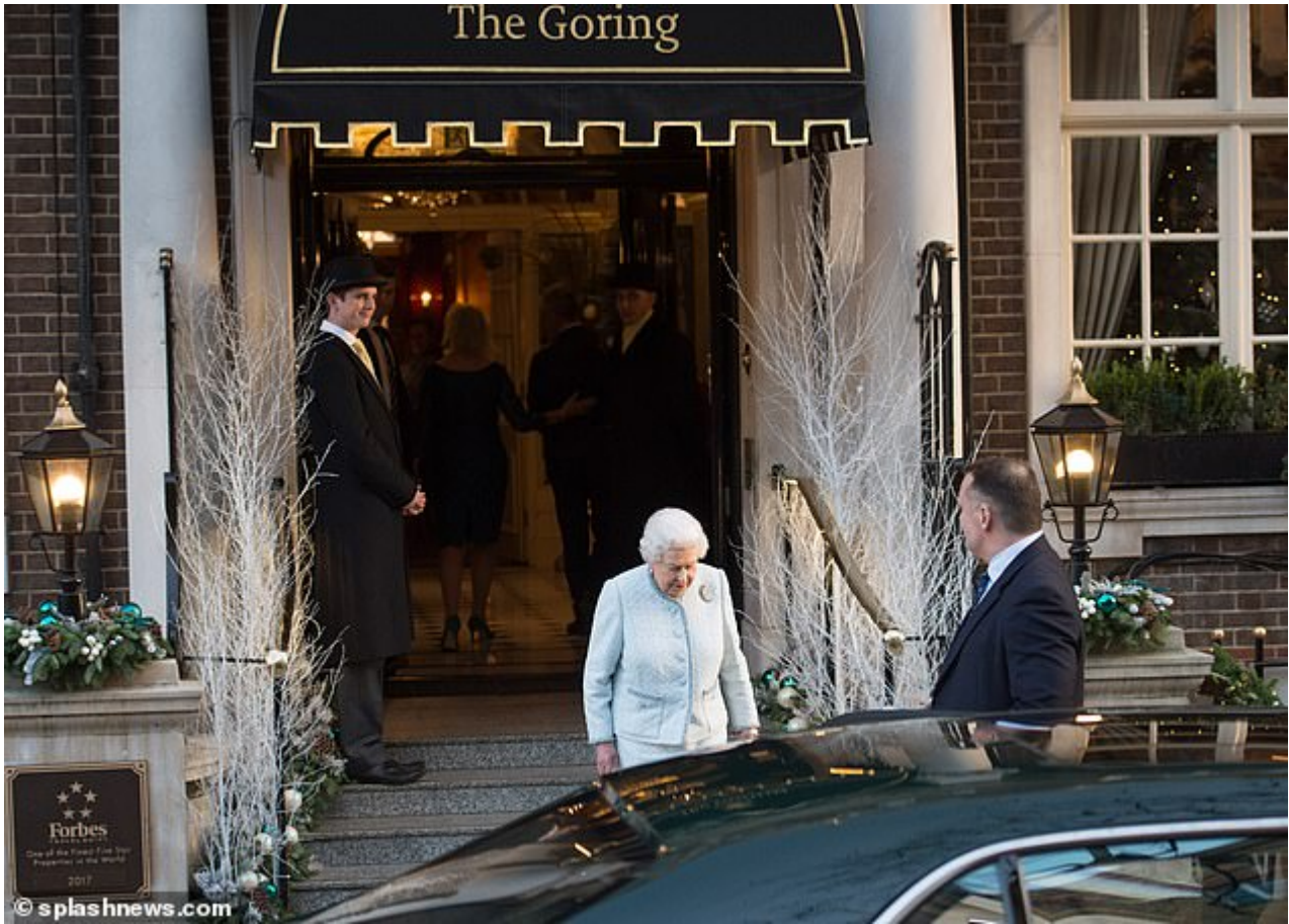
The Real LONDON HOTEL! We Love this hotel and the management!