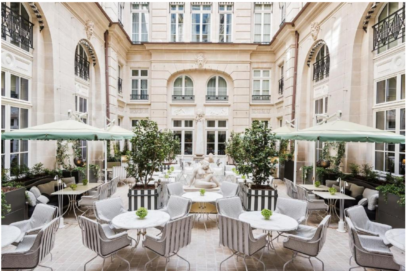
Place de la Concorde In the heart of Paris on the Champs de