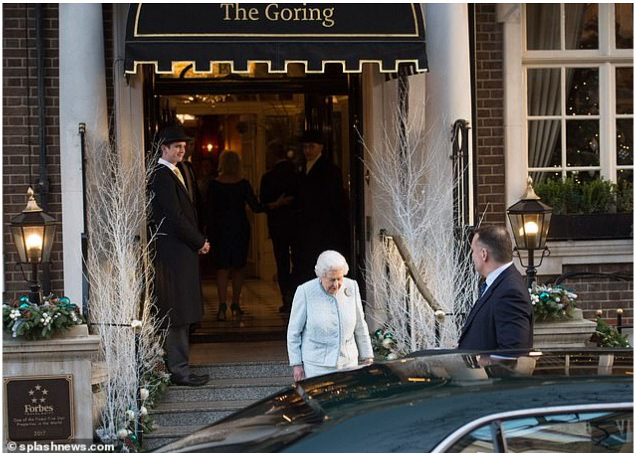
The Real LONDON HOTEL! We Love this hotel and the management!