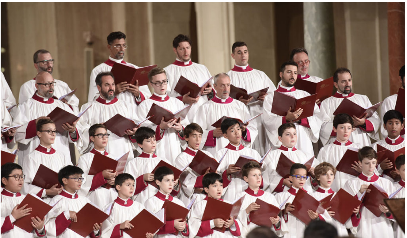
South Korean Children's Choir