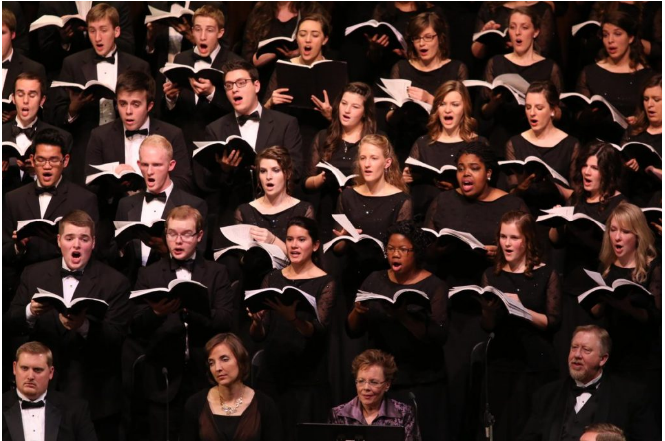
Kings College Choir Cambridge